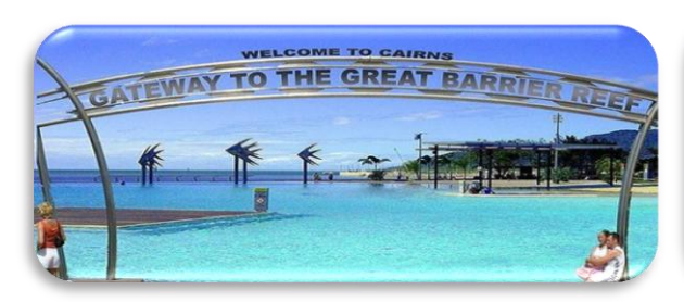
Day 14 - Cairns - Great Barrier Reef - Cairns

have Lunch at Frog Restaurant. Later board one way Kuranda Scenic Rail. Experience one of the most unique rail journeys, discovering the living color and natural beauty of a World Heritage-listed Rain Forest that millions of years old. Arrive at Freshwater station. Later transfer to Hotel check in, Dinner@ Indian restaurant. Overnight stay at hotel Cairns.